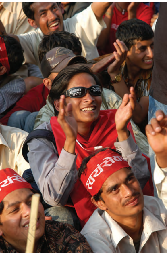
Political parties and people of Nepal in a rally demanding restoration of democracy in their country

All the major political parties in the parliament formed a Seven Party Alliance (SPA) and called for a four-day strike in Kathmandu, the country's capital. This protest soon turned into an indefinite strike in which MAOIST insurgents and various other organisations joined hands. People defied curfew and took to the streets. The security forces found themselves unable to take on more than a lakh people who gathered almost every day to demand restoration of democracy. The number of protesters reached between three and five lakhs on 21 April and they served an ultimatum to the king. The leaders of the movement rejected the halfhearted concessions made by the king. They stuck to their demands for