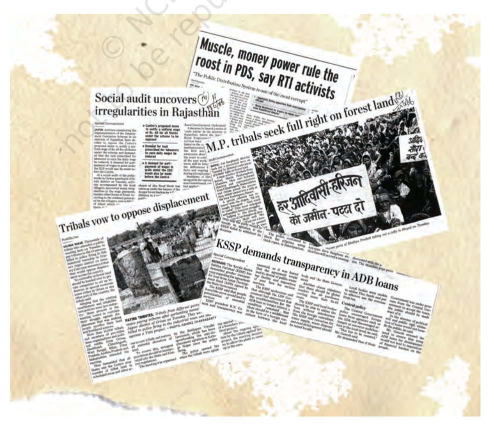
What are the social movements listed in these news clippings? What efforts are they making? Which sections are they trying to mobilise?